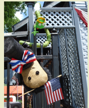
Two pythons were spotted at the G.A.R. Hall—Abraham Slincoln and Monty Python

The exciting annual Chamber event is always capped off by the slithering of a 100 foot canvas python supported by village children making its way up Route 303 to the Library on Riverview Road. If you missed it this year, plan to join us in 2012!