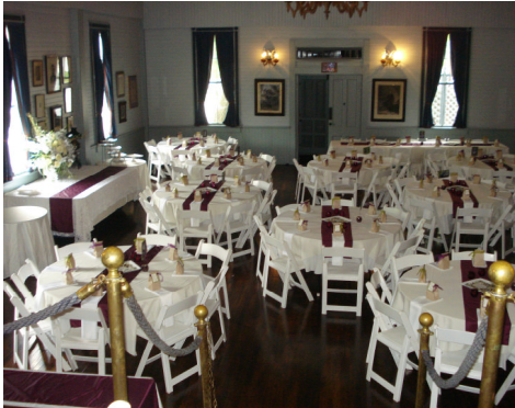
Ballroom is elegant in white table settings or traditional red with deep blue and seats up to 150 guests

Planning an event? The G.A.R. Hall is the perfect place to host showers, meetings, reunions, wedding receptions, graduation parties, and family gatherings!