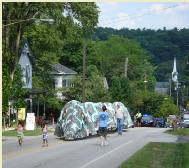
The "Python Posse" of local youngsters walking up the hill beneath the 100ft. python assembled by Larry Bell